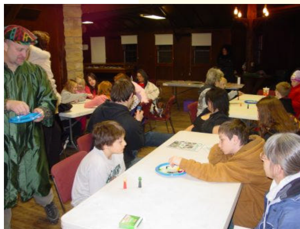
Members from the Magical Muggles 4-H Club participate in a “magical potions” activity and play the games that they created.