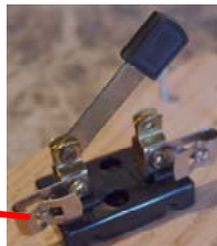
Knife Switch (close-up)

Fahnestock clips Allow wire ends to be connected to switches, lamps, etc. with less tools. Spring loaded clips.