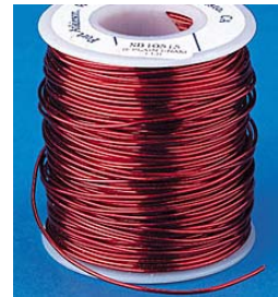
MAGNET WIRE (Also known as Enamel Coated Copper Wire.)

Price: $2.82 Price: $10.56 per SPOOL Price: $9.27 per 100' Price: $9.27 per 100' Price: $9.27 per 100' Price: $5.00 per 10