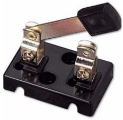
Single Pole Single Throw Knife Switch eNasco #SB09736M (sold in pkg. of 10 only) LOWES part# 96644