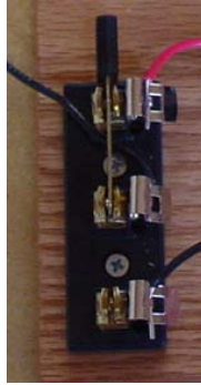
Single Pole Double Throw Knife Switch eNasco #SB09737M (sold in pkg. of 10 only) LOWES part# 139578