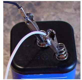
Alligator Clips (great for connecting to 6-volt lantern batteries). Found at Radio Shack, Hardware stores, automotive stores, and Building supply centers.