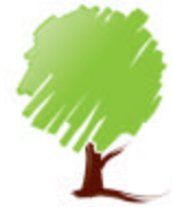
Exhibit Requirements (for all levels):