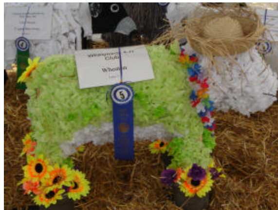
The Build-a-Critter Silent Auction is a popular event at fair.