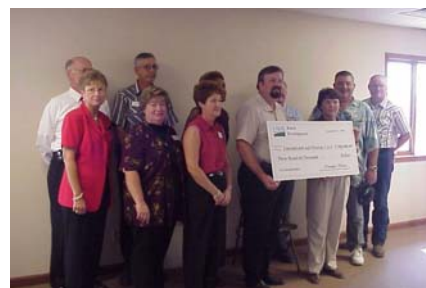
Lincolnland Agri-Energy receives $300,000 grant from USDA.