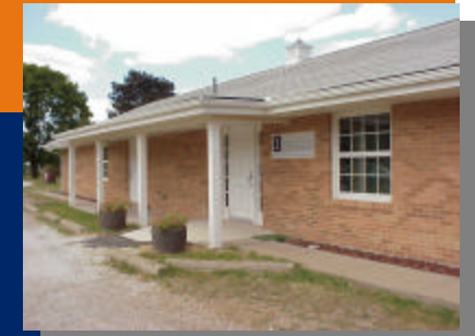
Schuyler County Office