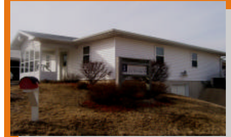
Cass County Office