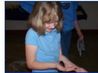
Cloverbuds explore many project areas, including environmental science.

not eligible to receive premiums. Cloverbuds do enjoy watching the older members exhibit, and receiving positive comments on their project displays.