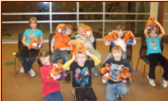
Cloverbuds enjoy learning to work together in small groups.

Cloverbuds may also participate in the Bureau County 4-H Fair through a non-competitive display of their work. Cloverbuds