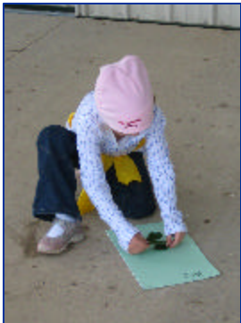
Cloverbuds learn through fun, hands-on activities.

Cloverbuds is a special 4-H program for youth ages 5-7 and not yet in third grade. A major goal is to help kids get excited about learning and have success in their efforts.